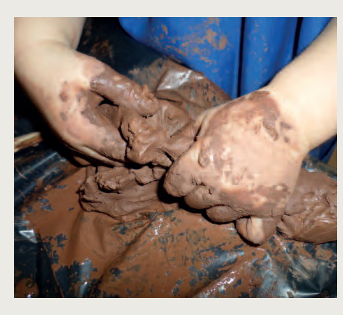
Fig. 5: Exploring water's effect on clay.

Tools and additional objects are not always necessary. Provide large chunks of clay to explore, perhaps even a whole bag. With younger children, putting the clay in a large tray and placing it on the floor will enable them to access it more easily. Provide water so they can explore how this changes the clay's texture. These exploratory sessions provide many opportunities for the children to find out what the clay can do, and develop understandings of cause and effect. Froebel saw his activities as part of a whole approach that provided children with opportunities to explore opposites. Exploratory sessions with clay will allow children to explore many of these opposites, such as wet and dry, smooth and rough, hard and soft and round and flat.