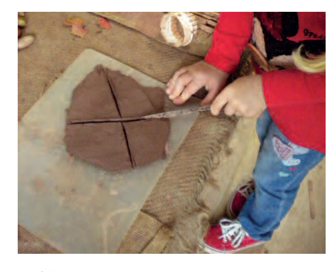
Fig. 3: The child has explored both two- and three-dimensional form, as she rolled the clay into a ball then used a rolling pin to make it flat. Through this, she has explored forms of knowledge as she has experienced volume, quantity and size. She plays imaginatively, turning her flat piece of clay into a 'birthday cake.' By representing something real, she produces a form of life. She explores mathematical concepts through cutting it up and dividing it into four and then placing a 'candle' (a stone) onto each piece. Through decorating her 'cake' and exploring its aesthetic qualities, she produces a form of beauty.